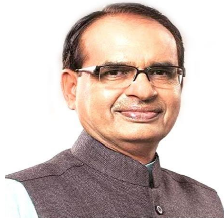
SHRI SHIVRAJ SINGH CHOUHAN Hon'ble Chief Minister of Madhya Pradesh